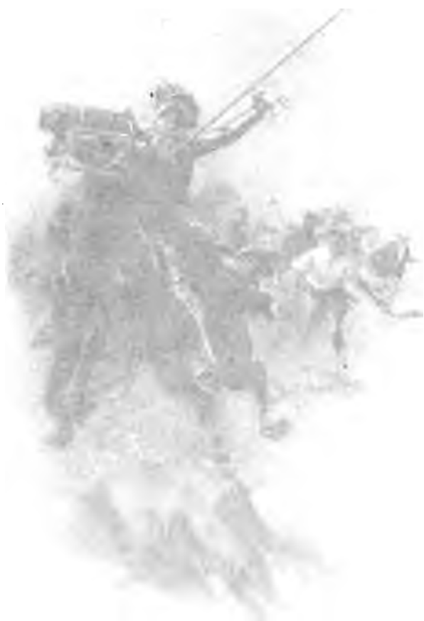
A man on foot, out after the outlaw.